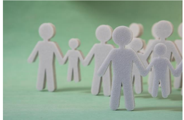
Brussels Canadian Military Community Center

CFMWS | MFS | OUTCAN Europe | CFMWS – Europe CFMWS | MFS | OUTCAN Europe | CFMWS – Brussels